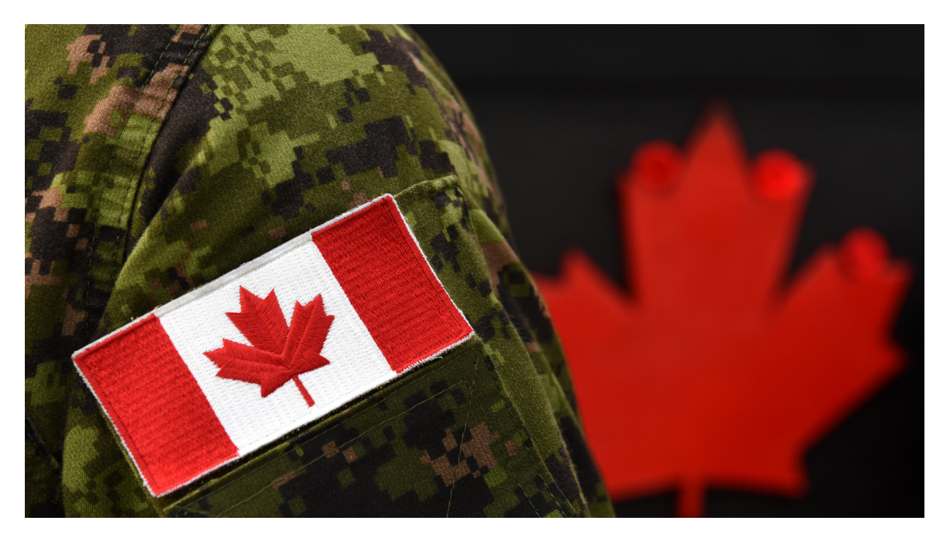
The Roles of Personality and Resiliency in Veteran Mental Health

Canadian Armed Forces (CAF) Veterans encounter unique challenges associated with their service. Exposure to deployment-related experiences places them at high risk for developing symptoms of mental health disorders, including symptoms of PTSD, depression, and anxiety. Understanding risk factors associated with mental health disorders in CAF Veterans is imperative for military organizations to implement strategies to enhance their well-being. Researchers have identified some risk factors, including history of childhood trauma, age, gender, and education. However, it is plausible that individuals' personality traits may serve as influential risk or protective factors for CAF Veterans' mental health. For example, high levels of openness and trait resiliency may serve as protective factors against adverse mental health outcomes, whereas high neuroticism may be a risk factor. Research is urgently required to evaluate the role of traits as risk and protective factors for Veteran mental health. Thus, our research team is evaluating 1) whether six broad personality traits (openness, agreeableness, emotionality, honesty-humility, conscientiousness, extraversion) predict levels of depression, anxiety, and PTSD among Veterans; 1b) whether resiliency serves as an intermediary in the relation between personality and mental health; 2) whether relations between combat exposure and PTSD are stronger for those higher in maladaptive traits and weaker for those higher in adaptive traits.