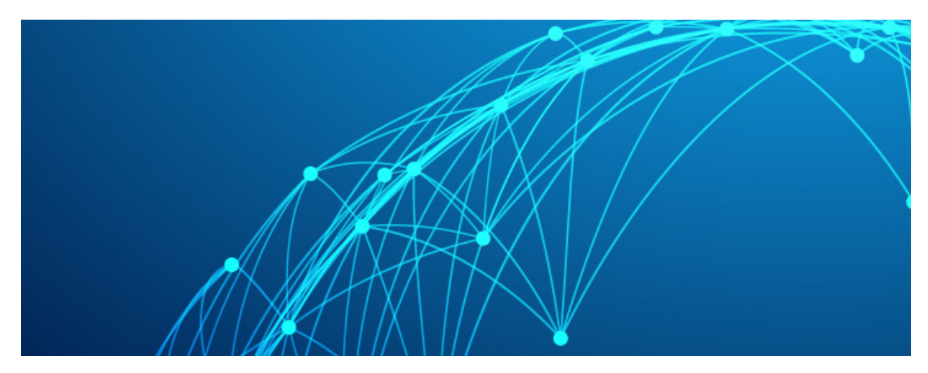
Epidemiological Analysis of the Mental Health and Well-being of Canadian Armed Forces and Veterans

The Canadian Armed Forces Members and Veterans Mental Health Follow-up Survey (CAFVMHS) is a nationwide initiative conducted by Statistics Canada to follow-up with respondents of the 2002 Canadian Community Health Survey: Canadian Forces Supplement on Mental Health. The purpose of the CAFVMHS is to examine the longitudinal mental health outcomes of Canadian Armed Forces members, some of which have since released. This is the first longitudinal survey of military and Veteran mental health in the world that uses gold standard epidemiological survey methodology. In collaboration with other researchers across Canada, we are leading analyses in two major research domains (see below).